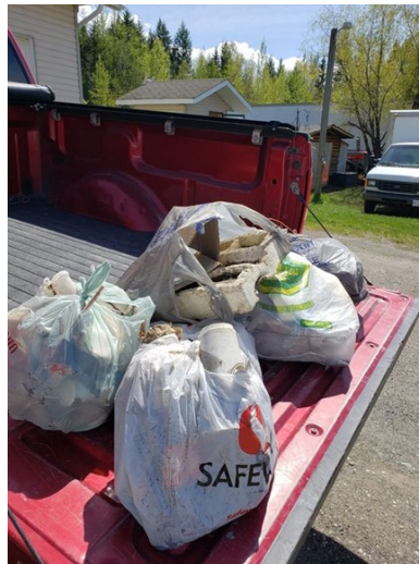
Diana Puhallo; cleaned up Teofil Road