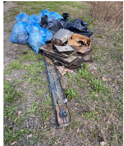
Litter removed from the pullout across from Quesnel Golf Course area.